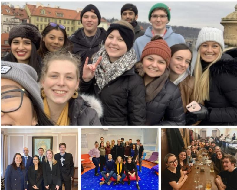
Figure 1. Rich Text Collected from Student Experiences in the Program