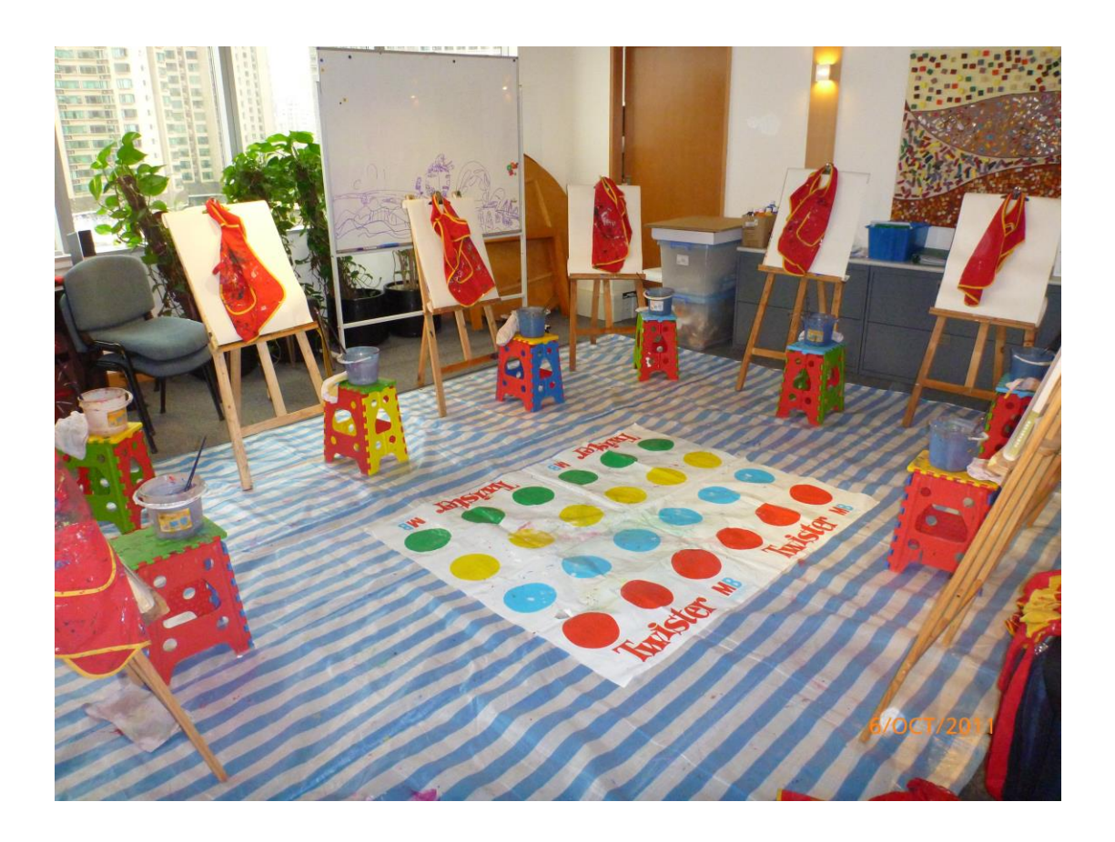
Figure 1. Photograph of the instructional setting