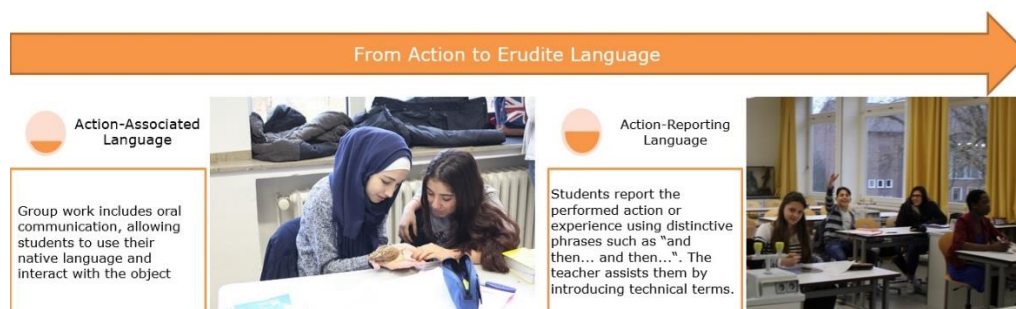
Figure 2. From action to erudite language (part I)

Leisen (2015) postulates four levels of language-use based on Gibbon’s model (2006) and describes how language can transition from “action” to “erudite” in the classroom. Both linguistic and content complexity increase throughout the task, which gradually leads students to a higher level of abstraction 4 . Students encounter an interactive scientific phenomenon, use group-work to discuss the subject using their own words (which can either be in their native language or in German), and often point directly to the object. Using action-associated language, they do not need technical terms as they are able to talk with their peers using the linguistic resources they already feel comfortable with (Leisen, 2015, p. 132; cf. Figure 2). Since they can physically show what they are referring to, they do not need to include correct terms or full sentences (Gibbons, 2006, p. 272).